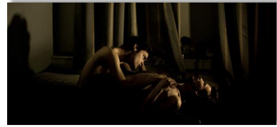
Image of Russian gay couple wins World Press Photo