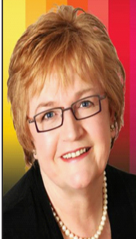
Gay Pride Parade, Hong Kong, China