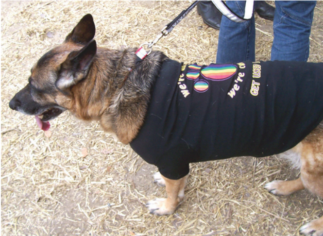
Photo: A German Shepard marching at Pride 2005.

One of the biggest events on Brisbane's social calendar is Pride Day. Now in its 17th year, the Brisbane Pride festival brings together LGBTI (lesbian, gay, bisexual, transgender and intersex) members of our community - including their families, parents, friends - even their pets!